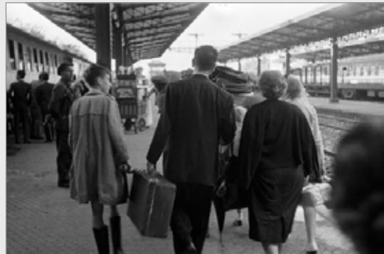
ICAS-SAHP, Fototeca Municipal de Sevilla. Archivo Serrano, 1961.

Migration of people from rural areas to cities, in search of new job opportunities. Rural migration began in the 19th century during the Industrial Revolution, and has been the cause of rural population depletion ("ghost towns") and urban overpopulation ("slums", "dormitory suburbs").